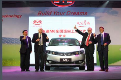
Visits of Warren Buffet, Charles Thomas Munger and Bill Gates

On September 27, 2010, Warren Buffet, Charles Thomas Munger and Bill Gates traveled thousands of miles to China, paying a four-day visit to BYD.